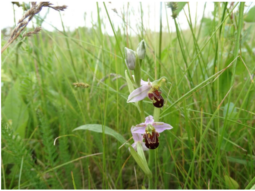
A bit early, but you might find the fabulous Bee Orchid