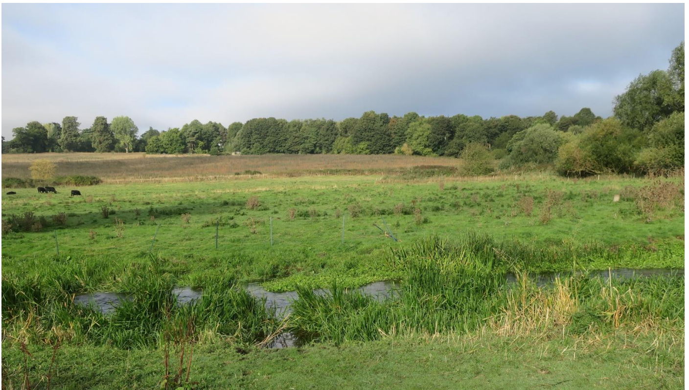
River Yare in foreground, development proposed in wooded area in background: looking WNW from Bowthorpe Southern Park

A good starting point for understanding the proposals can be found under the documents tab: Landscape & visual appraisal .