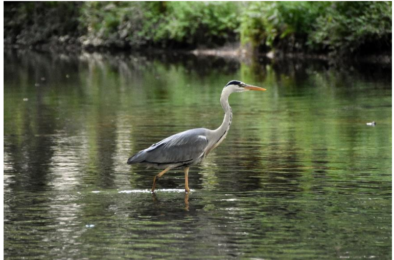
River Yare at Eaton Watermeadow