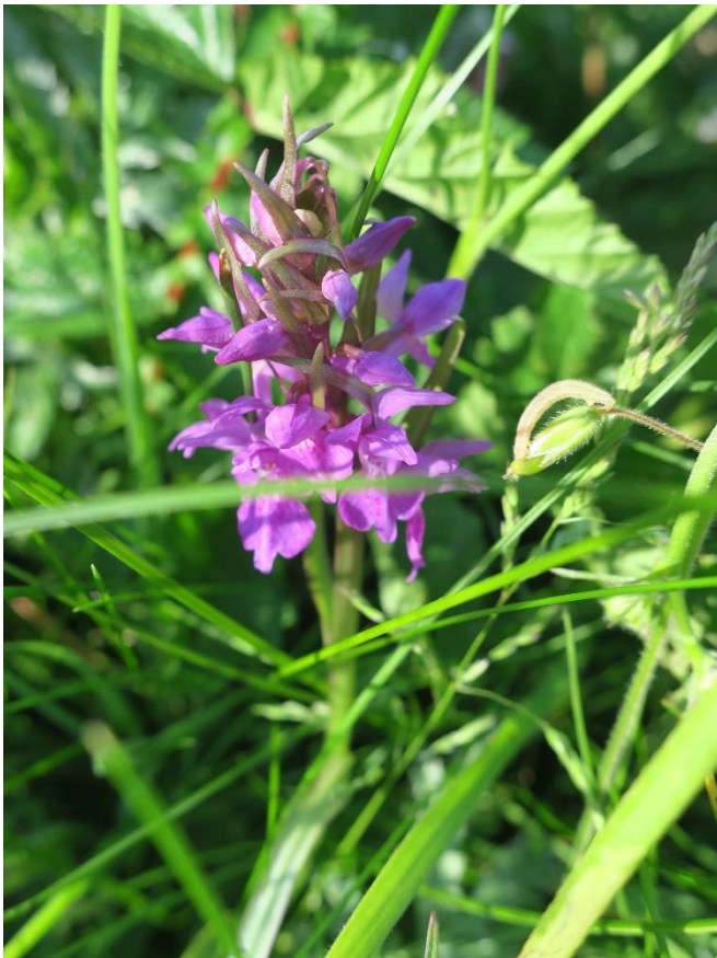
On Marston Marsh