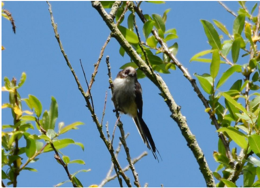
On Eaton Watermeadow

A recently announced YouGov Poll commissioned by the National Trust, Royal Society for the Protection of Birds and the World Wildlife Fund found that 81% of adults believe that nature is under threat and that more needs to be done to protect and restore it.