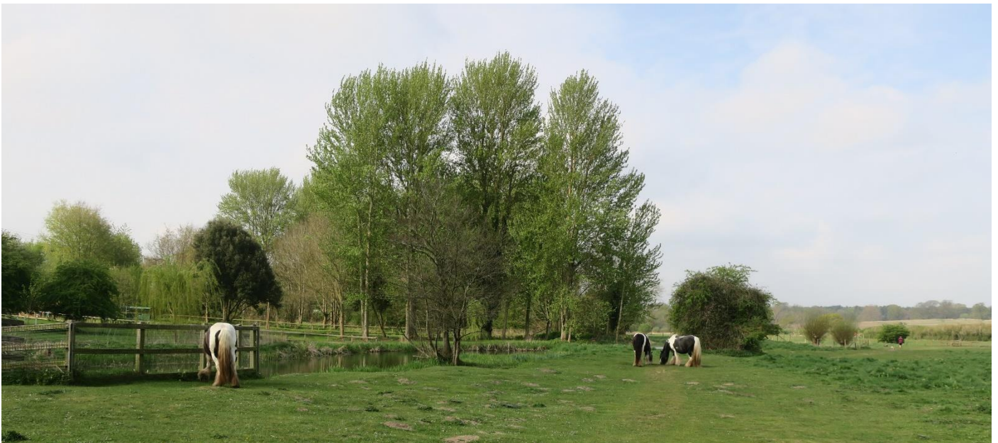
Tranquillity on Bowthorpe Southern Park. Colney Hall Estate in background right

(Technically the deadline for responses has passed, but the South Norfolk Planning Department have assured YVS that comments will continue to be accepted up to the time of determination of the application. Please submit your comments ASAP)