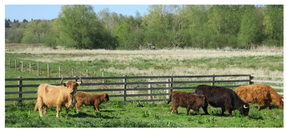
Grazing longhorns improve biodiversity at Harford Bridge Marsh

The NWT appeal for funds to purchase and manage Sweet Briar Marshes in the Wensum Valley green corridor continues. The Wensum corridor, in common with the Yare Valley green corridor, is threatened by urban development. The new nature reserve will be free to visit when it opens to the public. More details at <a href="https://www.norfolkwildlifetrust.org.uk/support-us/sweet-briar-marshes-appeal">https://www.norfolkwildlifetrust.org.uk/support-us/sweet-briar-marshes-appeal</a>